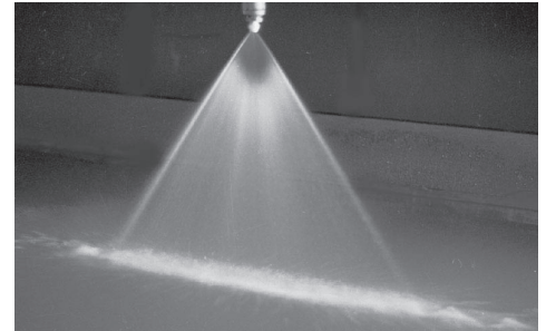
Spray angle not exactly as shown